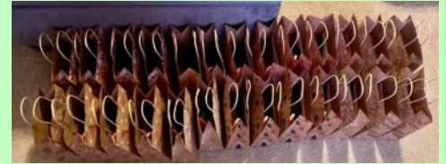
The 26 gift bags ready to be delivered.