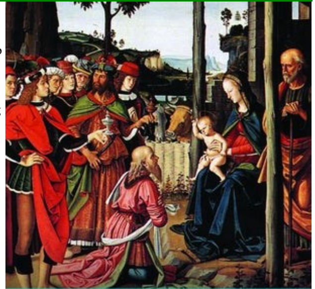
THE EPIPHANY OF THE LORD

“And behold, the star that they had seen at its rising preceded them, until it came and stopped over the place where the child was.” The light has come into the (Cont'd on p. 2 →)