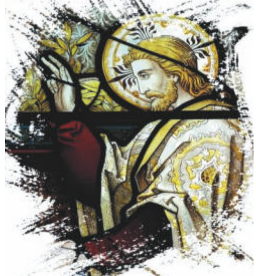
"BE OPENED!" - MK 7:34

Life can be challenging and frightening. Sometimes, it really hurts to be a human being. It also can be quite unpredictable and, at times, unfair. We face our vulnerability and brokenness of all kinds: physical, emotional, and spiritual. It doesn't take much for life to quickly fall apart. What we knew to be familiar and true is gone and something we relied upon, physically, emotionally, or spiritually, can be taken away. It is hard to confront our limitations and sit with our incompleteness. Often, life hurts us so much that we find ourselves sitting in a pool of sadness, not sure what we are supposed to do. It is particularly hard when the signals we have inherited tell us that we need to be successful in what we do, and we have to avoid life's unfairness. We can feel like a failure, wondering what precisely we did to deserve this fate, or ruminate about what we did not do correctly. But it's really not about us. We are part of a bigger picture and a much more fascinating story!